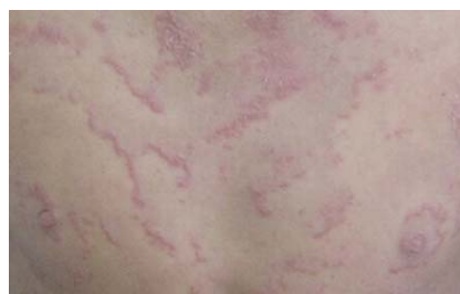
Figure 3a: Ichthyosis linearis circumflexa over the trunk.