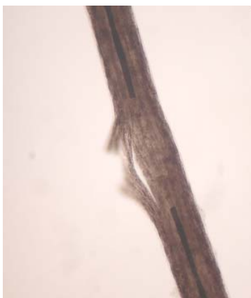
Figure 4 a: Hair shaft defect seen by light microscopy: trichorrhexis.