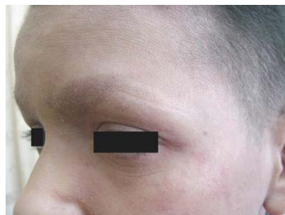
Figure 2: Short, lusterless, and sparse hair.

Management: The patient has been started on regular antihistamines (hydroxyzine hydrochloride and loratadine), emollients and keratolytics (5% lactic acid). Mild topical steroids were prescribed to be used intermittently for facial lesions. Most recently, he was started on topical pimecrolimus, which is showing promising symptomatic relief.