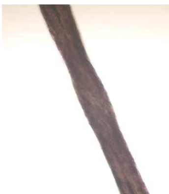
Figure 4 b: Hair shaft defect seen by light microscopy: pili torti.